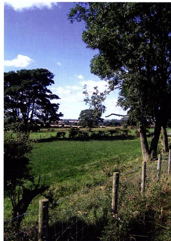
The view towards Lutterington.

Three short walks out from the village to the surrounding countryside